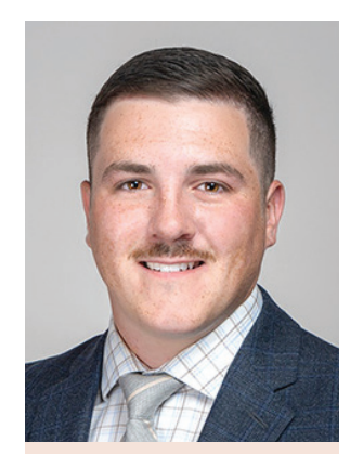
Odyssey Virtual.

"The concept for Odyssey Virtual began while volunteering with a UPEI engineering team. The team built and raced an offroad vehicle in an international competition.