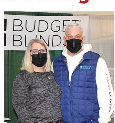
Owners of Budget Blinds.